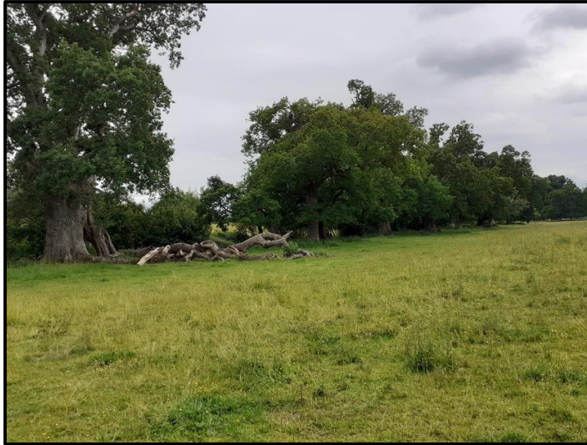
Photograph 17, to the west of CE1 looking towards the line of the route between CE1 and CE2