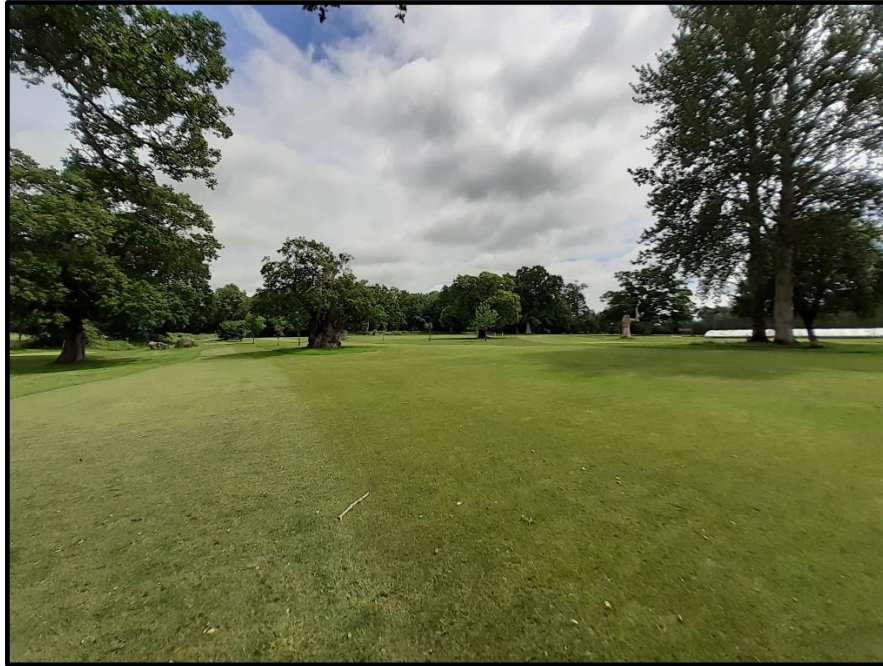
Photograph 9, near point A3 looking across school sports grounds towards point B