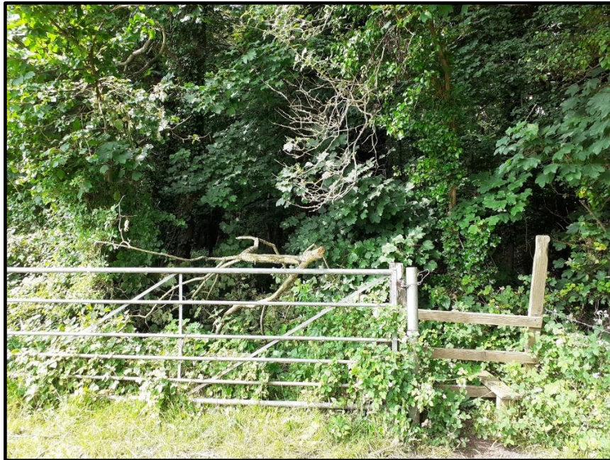
Photograph 24, at point CE3 looking towards point E