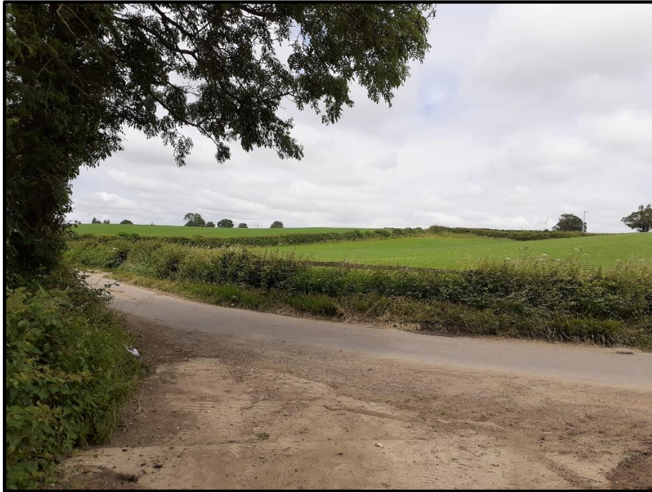
Photograph 1, at point A looking north onto Babcary Road

Source: officer site visits 24 & 30 June 2021