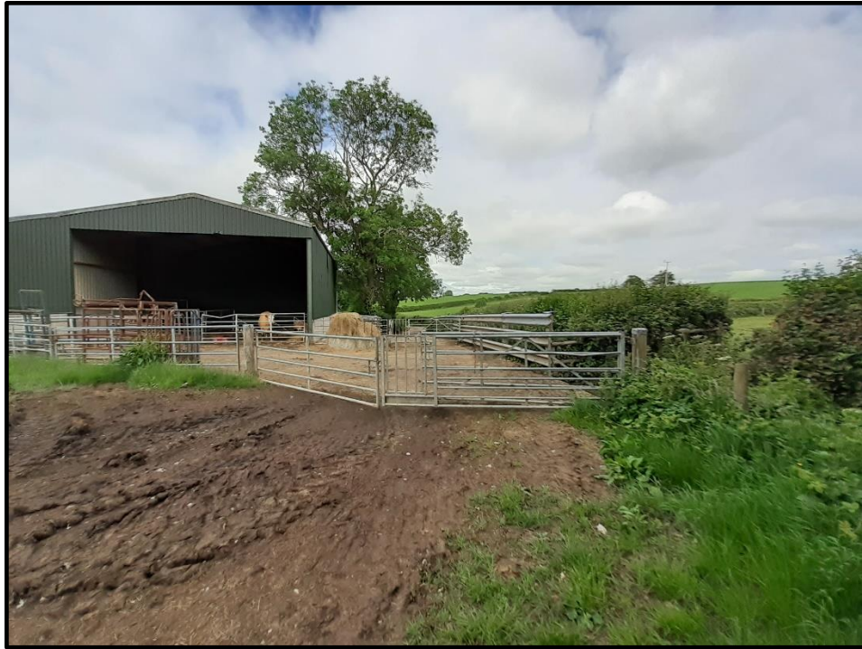
Photograph 3, just south of point A looking back towards point A