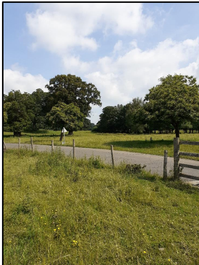
Photograph 22, to the south-west of Hazlegrove School drive looking towards CE2