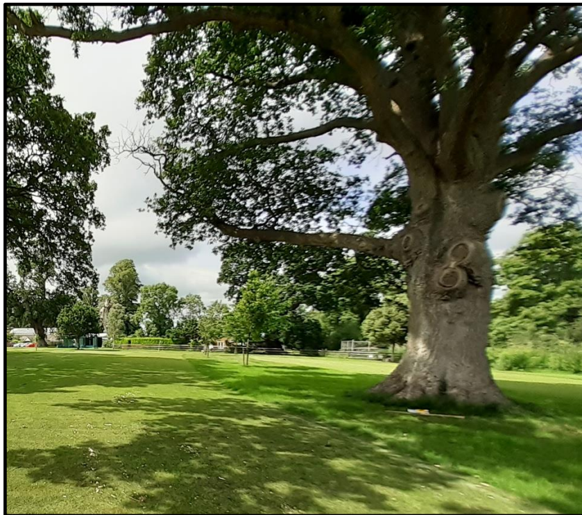
Photograph 10, between points A3 and B looking towards point A3